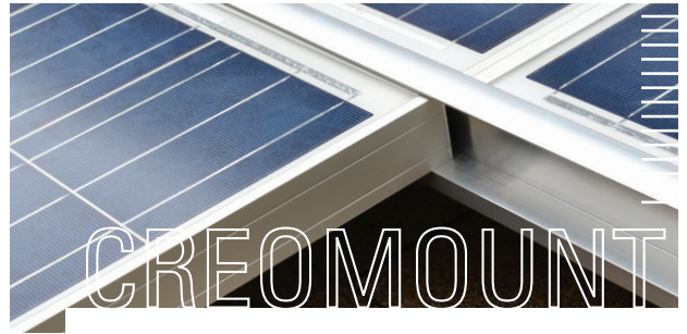
Pitched Roof Solution