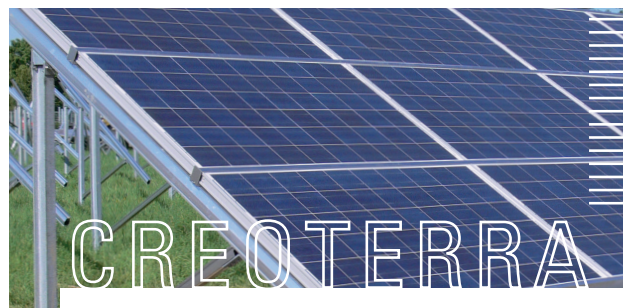
Ground Mount Solution