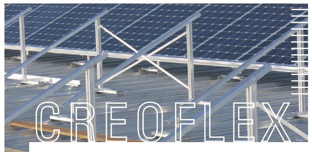
Flat Roof Solution